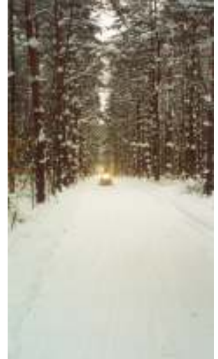
Our winter wonderland

**It has been verified that this price includes composting. Waste-Away offers a new customer discount of $30.00 for the first quarter only. Do note that Waste-Away keeps its costs low by only picking up recyclables twice a month.