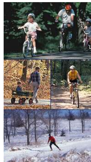
Life around town